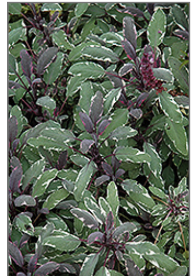
Tricolor Sage foliage