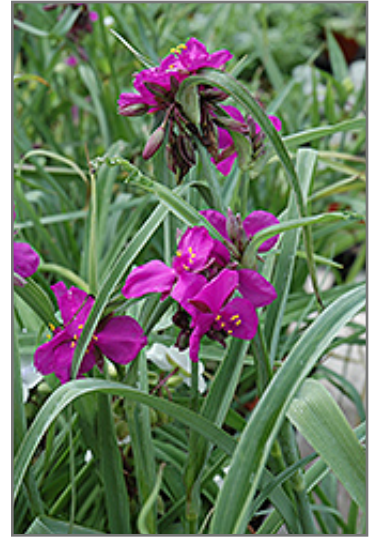
Red Grape Spiderwort flowers