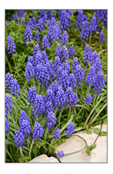
Grape Hyacinth flowers

Grape Hyacinth will grow to be only 4 inches tall at maturity extending to 8 inches tall with the flowers, with a spread of 4 inches. It grows at a medium rate, and under ideal conditions can be expected to live for approximately 5 years. As an herbaceous perennial, this plant will usually die back to the crown each winter, and will regrow from the base each spring. Be careful not to disturb the crown in late winter when it may not be readily seen! As this plant tends to go dormant in summer, it is best interplanted with late-season bloomers to hide the dying foliage.