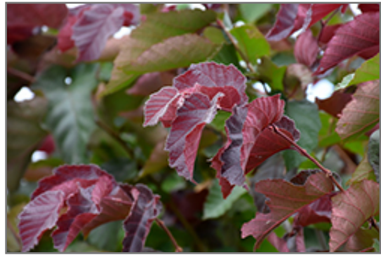
Purpleleaf Bailey Select American Hazelnut foliage