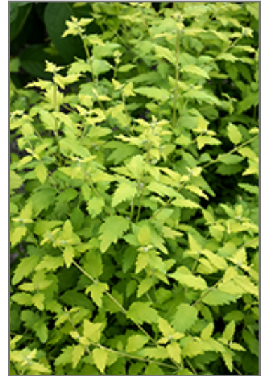
Sunshine Blue II Caryopteris foliage

Sunshine Blue II Caryopteris makes a fine choice for the outdoor landscape, but it is also well-suited for use in outdoor pots and containers. With its upright habit of growth, it is best suited for use as a 'thriller' in the 'spiller-thriller-filler' container combination; plant it near the center of the pot, surrounded by smaller plants and those that spill over the edges. It is even sizeable enough that it can be grown alone in a suitable container. Note that when grown in a container, it may not perform exactly as indicated on the tag - this is to be expected. Also note that when growing plants in outdoor containers and baskets, they may require more frequent waterings than they would in the yard or garden.