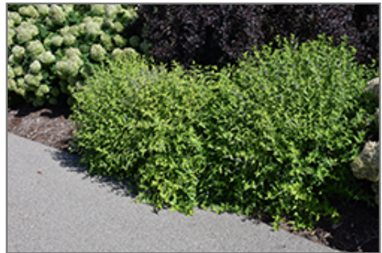
Sunshine Blue II Caryopteris in bloom