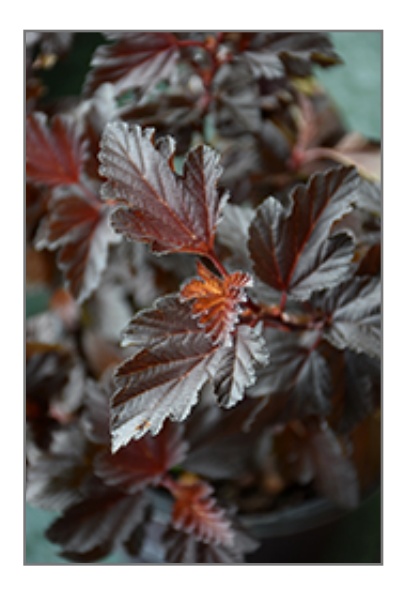
Fireside Ninebark flowers

This shrub will require occasional maintenance and upkeep, and can be pruned at anytime. It has no significant negative characteristics.