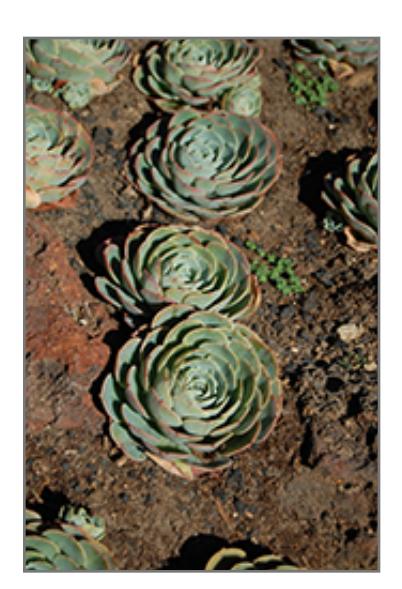
Blue Rose Echeveria