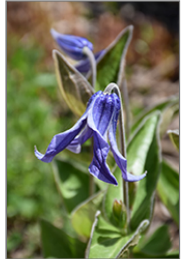
Blue Ribbons Bush Clematis flowers