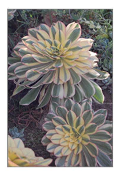
Sunburst Aeonium