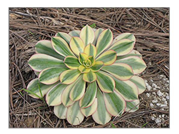
Sunburst Aeonium