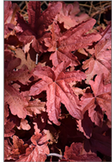
Fun and Games Red Rover Foamy Bells foliage

This is a relatively low maintenance plant, and should be cut back in late fall in preparation for winter. It is a good choice for attracting hummingbirds to your yard. It has no significant negative characteristics.