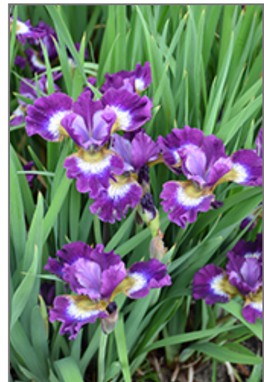
Contrast In Styles Siberian Iris flowers