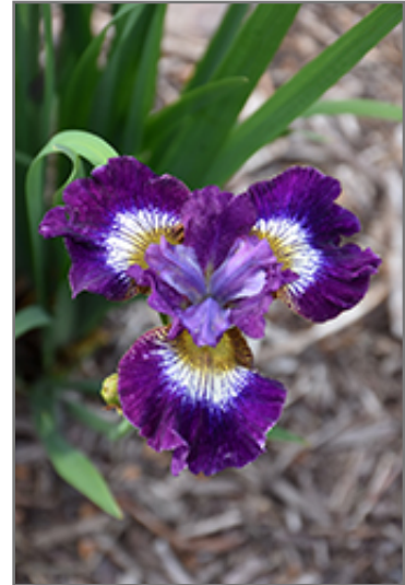
Contrast In Styles Siberian Iris flowers