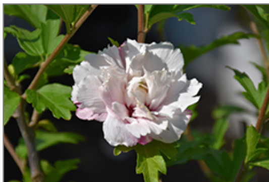
French Cabaret Blush Rose of Sharon flowers

French Cabaret Blush Rose of Sharon is recommended for the following landscape applications;