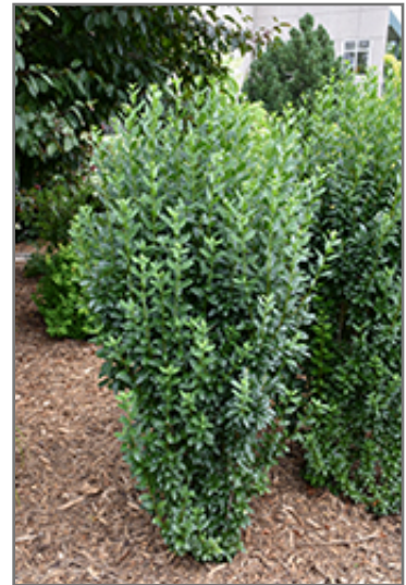
Straight Talk Privet