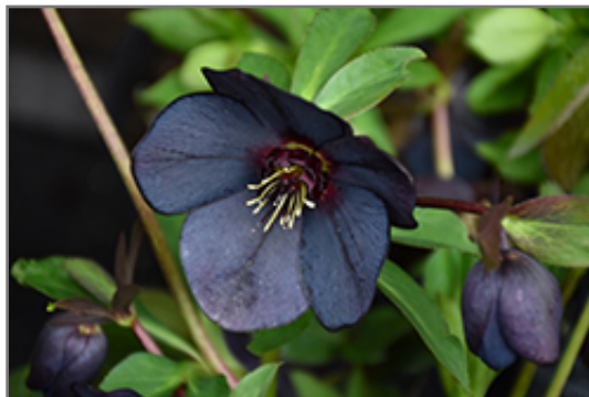
Winter Jewels Black Diamond Hellebore flowers

Winter Jewels Black Diamond Hellebore is recommended for the following landscape applications;