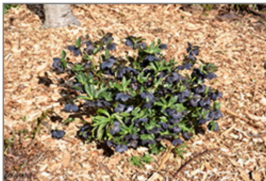
Winter Jewels Black Diamond Hellebore in bloom