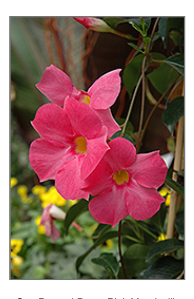
Sun Parasol Pretty Pink Mandevilla flowers

When grown indoors, Sun Parasol Pretty Pink Mandevilla can be expected to grow to be about 10 feet tall at maturity, with a spread of 24 inches. It grows at a medium rate, and under ideal conditions can be expected to live for approximately 20 years. This houseplant will do well in a location that gets either direct or indirect sunlight, although it will usually require a more brightly-lit environment than what artificial indoor lighting alone can provide. It requires an evenly moist well-drained soil for optimal growth. The surface of the soil shouldn't be allowed to dry out completely, and so you should expect to water this plant once and possibly even twice each week. Be aware that your particular watering schedule may vary depending on its location in the room, the pot size, plant size and other conditions; if in doubt, ask one of our experts in the store for advice. It is not particular as to soil type or pH; an average potting soil should work just fine. Be warned that parts of this plant are known to be toxic to humans and animals, so special care should be exercised if growing it around children and pets.