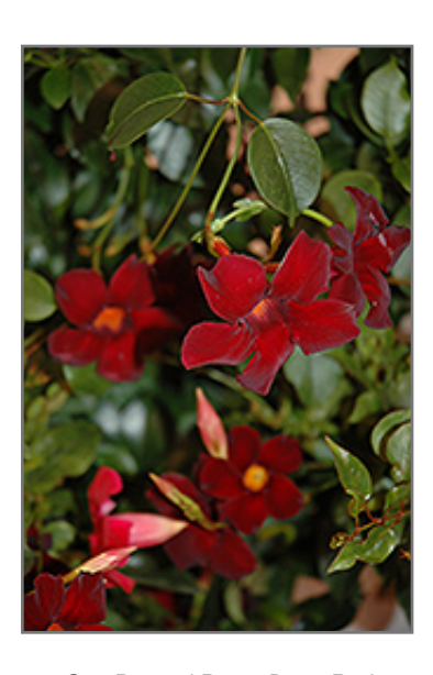
Sun Parasol Pretty Deep Red Mandevilla flowers

When grown indoors, Sun Parasol Pretty Deep Red Mandevilla can be expected to grow to be about 10 feet tall at maturity, with a spread of 24 inches. It grows at a medium rate, and under ideal conditions can be expected to live for approximately 20 years. This houseplant will do well in a location that gets either direct or indirect sunlight, although it will usually require a more brightly-lit environment than what artificial indoor lighting alone can provide. It requires an evenly moist well-drained soil for optimal growth. The surface of the soil shouldn't be allowed to dry out completely, and so you should expect to water this plant once and possibly even twice each week. Be aware that your particular watering schedule may vary depending on its location in the room, the pot size, plant size and other conditions; if in doubt, ask one of our experts in the store for advice. It is not particular as to soil type or pH; an average potting soil should work just fine. Be warned that parts of this plant are known to be toxic to humans and animals, so special care should be exercised if growing it around children and pets.