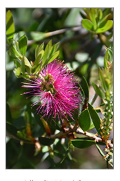
Jeffers Bottlebrush flowers

When grown indoors, Jeffers Bottlebrush can be expected to grow to be about 4 feet tall at maturity, with a spread of 3 feet. It grows at a medium rate, and under ideal conditions can be expected to live for approximately 30 years. This houseplant will do well in a location that gets either direct or indirect sunlight, although it will usually require a more brightly-lit environment than what artificial indoor lighting alone can provide. It prefers to grow in average to moist soil. The surface of the soil shouldn't be allowed to dry out completely, and so you should expect to water this plant once and possibly even twice each week. Be aware that your particular watering schedule may vary depending on its location in the room, the pot size, plant size and other conditions; if in doubt, ask one of our experts in the store for advice. It is not particular as to soil type or pH; an average potting soil should work just fine.