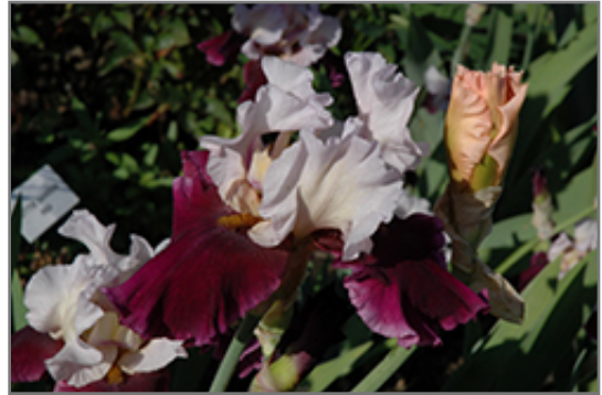
Brazilian Holiday Iris flowers