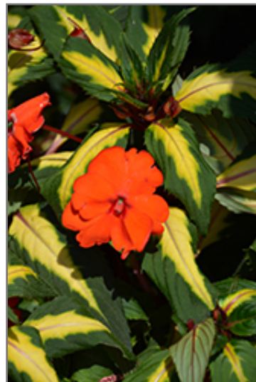
SunPatiens Spreading Tropical Orange New Guinea Impatiens flowers

This plant will require occasional maintenance and upkeep, and should not require much pruning, except when necessary, such as to remove dieback. It has no significant negative characteristics.