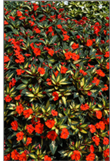
SunPatiens Spreading Tropical Orange New Guinea Impatiens flowers

SunPatiens Spreading Tropical Orange New Guinea Impatiens is a fine choice for the garden, but it is also a good selection for planting in outdoor containers and hanging baskets. It can be used either as 'filler' or as a 'thriller' in the 'spiller-thriller-filler' container combination, depending on the height and form of the other plants used in the container planting. It is even sizeable enough that it can be grown alone in a suitable container. Note that when growing plants in outdoor containers and baskets, they may require more frequent waterings than they would in the yard or garden.