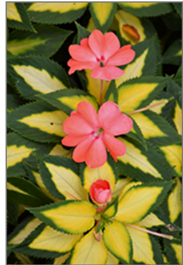
SunPatiens Spreading Salmon New Guinea Impatiens flowers

This plant will require occasional maintenance and upkeep, and should not require much pruning, except when necessary, such as to remove dieback. It is a good choice for attracting bees and butterflies to your yard. It has no significant negative characteristics.