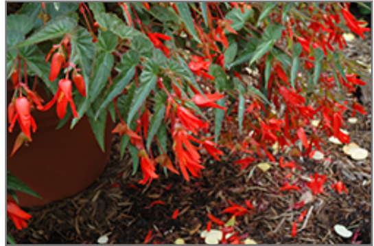
Santa Cruz Begonia flowers