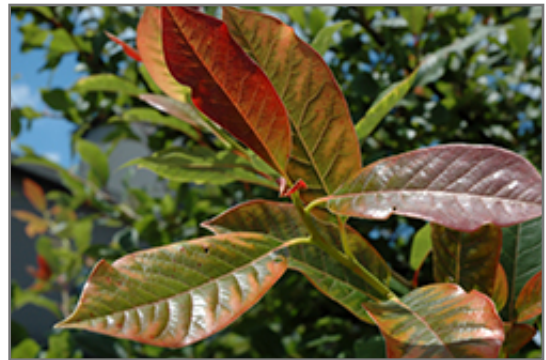
Afterburner Black Gum foliage