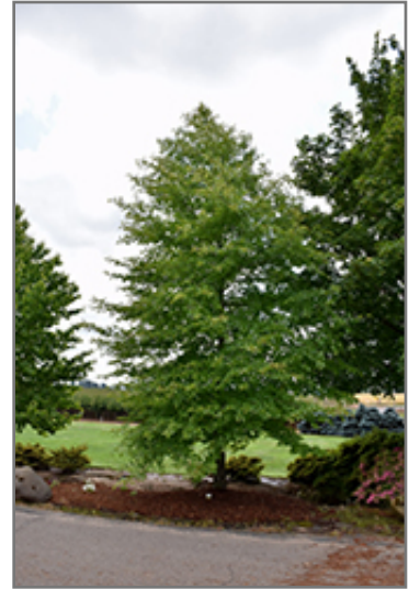
Afterburner Black Gum

Afterburner Black Gum is recommended for the following landscape applications;