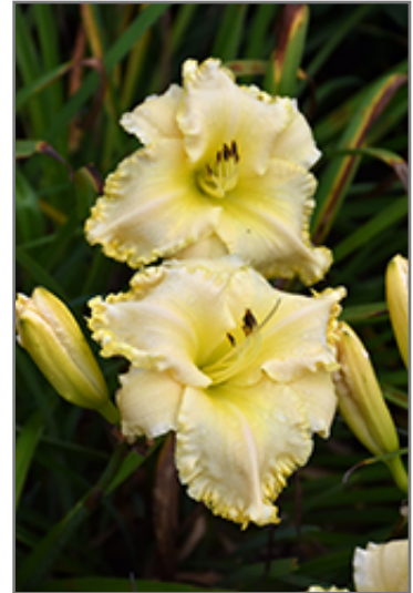
Marquee Moon Daylily flowers