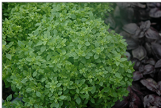
Aristotle Basil