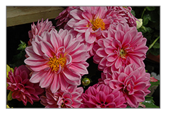
Dahlinova Hypnotica Pink Dahlia flowers

Dahlinova Hypnotica Pink Dahlia features showy hot pink daisy flowers with yellow eyes at the ends of the stems from mid to late summer. The flowers are excellent for cutting. Its serrated pointy leaves remain green in color throughout the season.