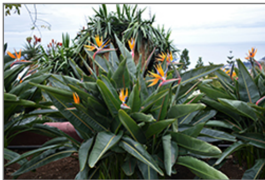
Orange Bird Of Paradise in bloom