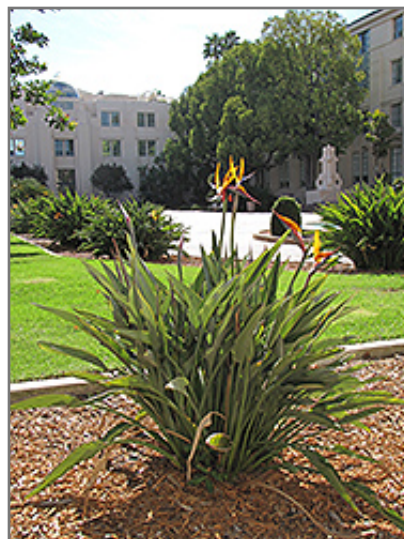
Orange Bird Of Paradise in bloom

Orange Bird Of Paradise is a fine choice for the garden, but it is also a good selection for planting in outdoor pots and containers. With its upright habit of growth, it is best suited for use as a 'thriller' in the 'spiller-thriller-filler' container combination; plant it near the center of the pot, surrounded by smaller plants and those that spill over the edges. It is even sizeable enough that it can be grown alone in a suitable container. Note that when growing plants in outdoor containers and baskets, they may require more frequent waterings than they would in the yard or garden. Be aware that in our climate, this plant may be too tender to survive the winter if left outdoors in a container. Contact our experts for more information on how to protect it over the winter months.