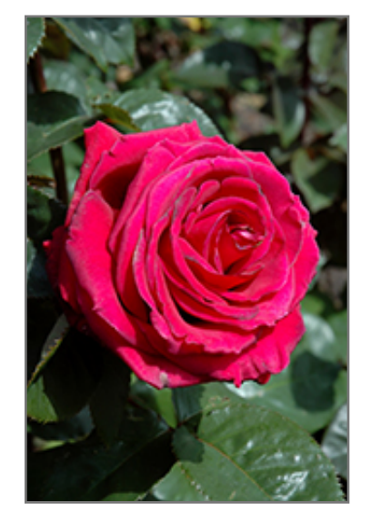
Firefighter Rose flowers