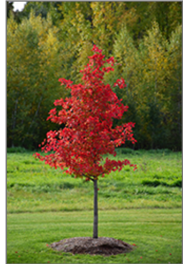
Wildfire Black Gum in fall