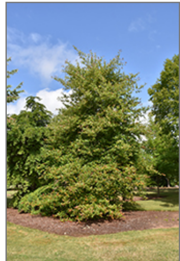
Wildfire Black Gum