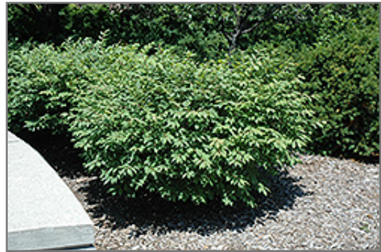
Fire Ball Burning Bush