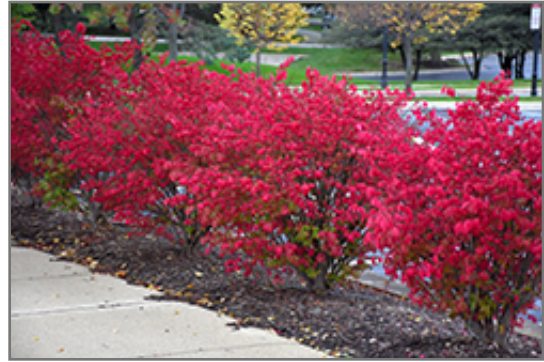
Fire Ball Burning Bush in fall

Fire Ball Burning Bush is recommended for the following landscape applications;