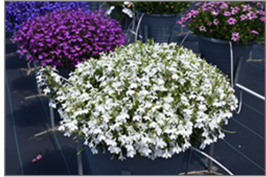
Techno Upright White Lobelia in bloom

Techno Upright White Lobelia is a fine choice for the garden, but it is also a good selection for planting in hanging baskets. Because of its trailing habit of growth, it is ideally suited for use as a 'spiller' in the 'spiller-thriller-filler' container combination; plant it near the edges where it can spill gracefully over the pot. Note that when growing plants in outdoor containers and baskets, they may require more frequent waterings than they would in the yard or garden.