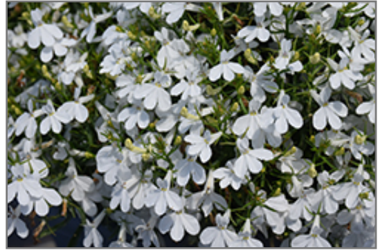
Techno Upright White Lobelia flowers

Techno Upright White Lobelia is recommended for the following landscape applications;