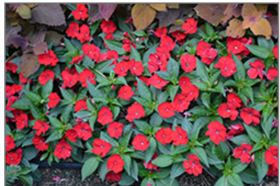
SunPatiens Compact Red New Guinea Impatiens in bloom