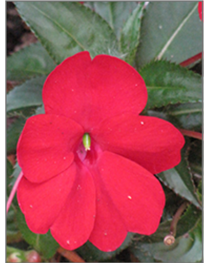
SunPatiens Compact Red New Guinea Impatiens flowers

This plant will require occasional maintenance and upkeep, and should not require much pruning, except when necessary, such as to remove dieback. It is a good choice for attracting bees and butterflies to your yard. It has no significant negative characteristics.