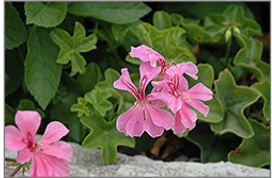
Crocodile Ivy Leaf Geranium flowers