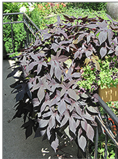
Proven Accents Blackie Sweet Potato Vine