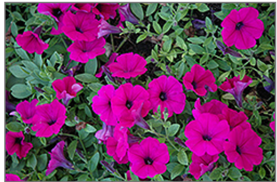
Wave Purple Classic Petunia flowers