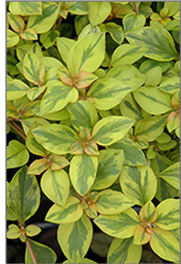
Walkabout Sunset Loosestrife foliage

Walkabout Sunset Loosestrife is recommended for the following landscape applications;