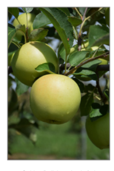
Golden Delicious Apple fruit

Golden Delicious Apple features showy clusters of lightly-scented white flowers with shell pink overtones along the branches in mid spring, which emerge from distinctive pink flower buds. It has forest green deciduous foliage. The pointy leaves turn yellow in fall. The fruits are showy chartreuse apples with yellow overtones, which are carried in abundance in mid fall. The fruit can be messy if allowed to drop on the lawn or walkways, and may require occasional clean-up.