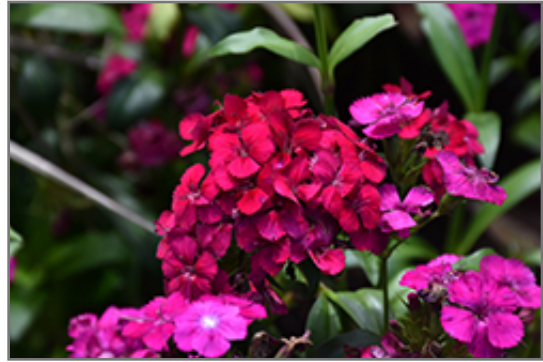
Amazon Neon Cherry Pinks flowers

Amazon Neon Cherry Pinks is a fine choice for the garden, but it is also a good selection for planting in outdoor pots and containers. Because of its height, it is often used as a 'thriller' in the 'spiller-thriller-filler' container combination; plant it near the center of the pot, surrounded by smaller plants and those that spill over the edges. Note that when growing plants in outdoor containers and baskets, they may require more frequent waterings than they would in the yard or garden.