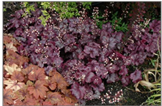
Plum Royale Coral Bells in bloom