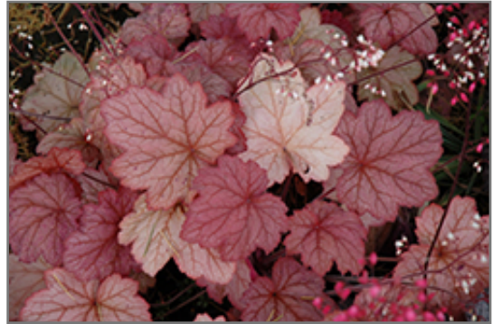
Georgia Peach Coral Bells foliage

Georgia Peach Coral Bells is recommended for the following landscape applications;