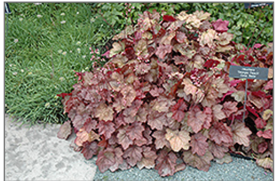
Georgia Peach Coral Bells