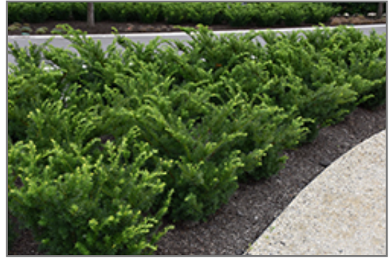
Densiformis Yew