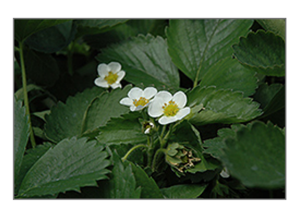
Everbearing Strawberry flowers