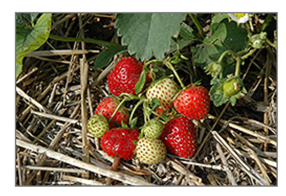
Everbearing Strawberry fruit