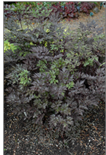
Black Negligee Bugbane