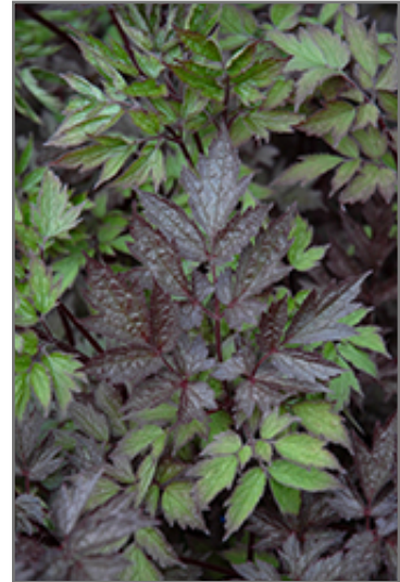
Black Negligee Bugbane foliage

Black Negligee Bugbane is recommended for the following landscape applications;