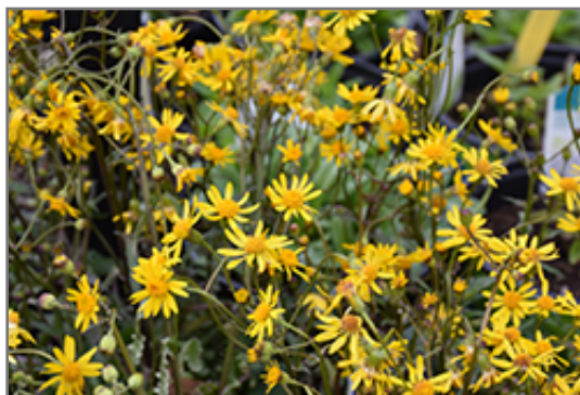
Golden Ragwort flowers