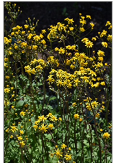
Golden Ragwort flowers