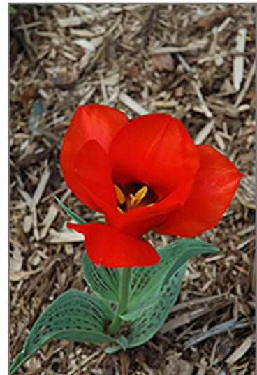
Casa Grande Tulip flowers