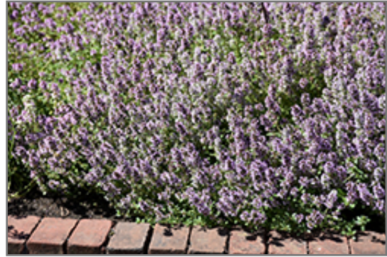
Common Thyme in bloom

Common Thyme is smothered in stunning clusters of pink flowers at the ends of the stems from early to mid summer. Its attractive tiny fragrant round leaves remain grayish green in color throughout the year.