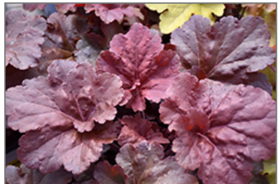
Primo Mahogany Monster Coral Bells foliage