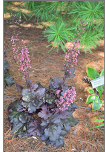
Primo Mahogany Monster Coral Bells in bloom

Primo Mahogany Monster Coral Bells is a fine choice for the garden, but it is also a good selection for planting in outdoor pots and containers. With its upright habit of growth, it is best suited for use as a 'thriller' in the 'spiller-thriller-filler' container combination; plant it near the center of the pot, surrounded by smaller plants and those that spill over the edges. Note that when growing plants in outdoor containers and baskets, they may require more frequent waterings than they would in the yard or garden.