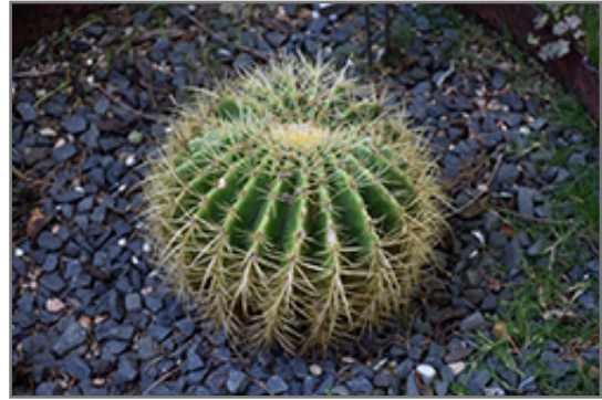
Golden Barrel Cactus

Golden Barrel Cactus is a succulent evergreen plant. It is a member of the cactus family, which are grown primarily for their characteristic shapes, their interesting features and textures, and their high tolerance for hot, dry growing environments. Like all cacti, it doesn't actually have leaves, but rather modified succulent stems that comprise the bulk of the plant, and which are designed to hold water for long periods of time. This particular cactus is valued for its distinctive barrel shape, and usually grows as a single spiny ribbed green stem. This plant has yellow cup-shaped flowers held atop the stems from late spring to early summer, which are interesting on close inspection.