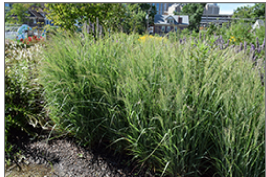
Prairie Winds Apache Rose Switch Grass