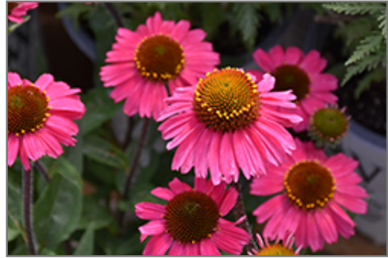
Sensation Pink Coneflower flowers

Sensation Pink Coneflower is recommended for the following landscape applications;