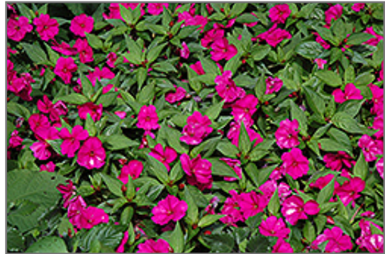
Big Bounce Violet Impatiens in bloom